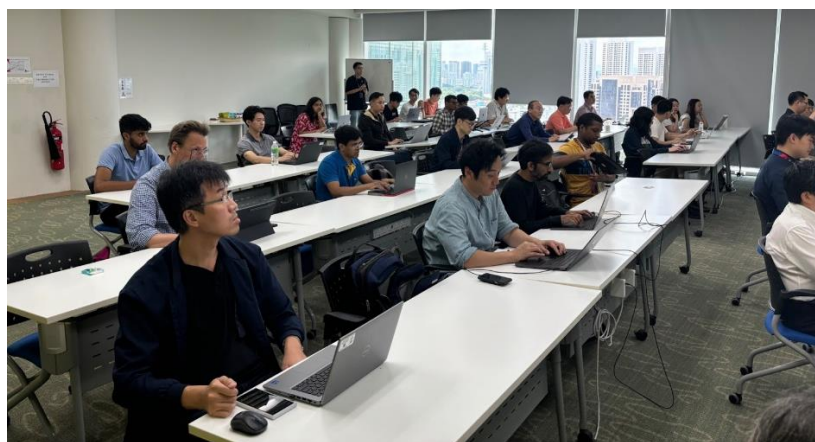
Advanced users at the ASPIRE 2A Optimisation Techniques Workshop

The introductory workshop for ASPIRE 2A provided new users with information on the overall setup of the ASPIRE 2A system. With a hands-on session, participants experienced the system onboarding process and learned how to submit job requests to the system.