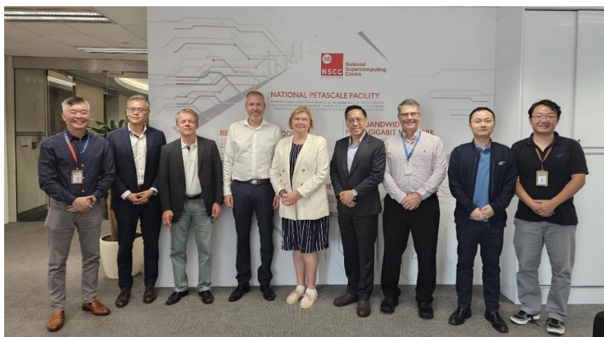
Trilateral meeting between CSC Finland, NSCC Singapore and A*STAR's IHPC