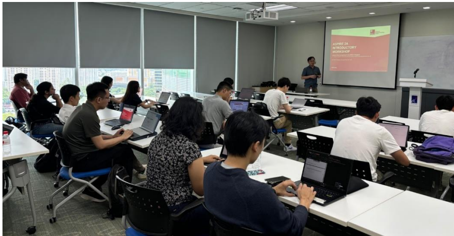
Attendees of the ASPIRE 2A Introductory Workshop

The workshops, attended by 56 users, were designed for participants with varying levels of HPC experience to learn more about using the ASPIRE 2A system.