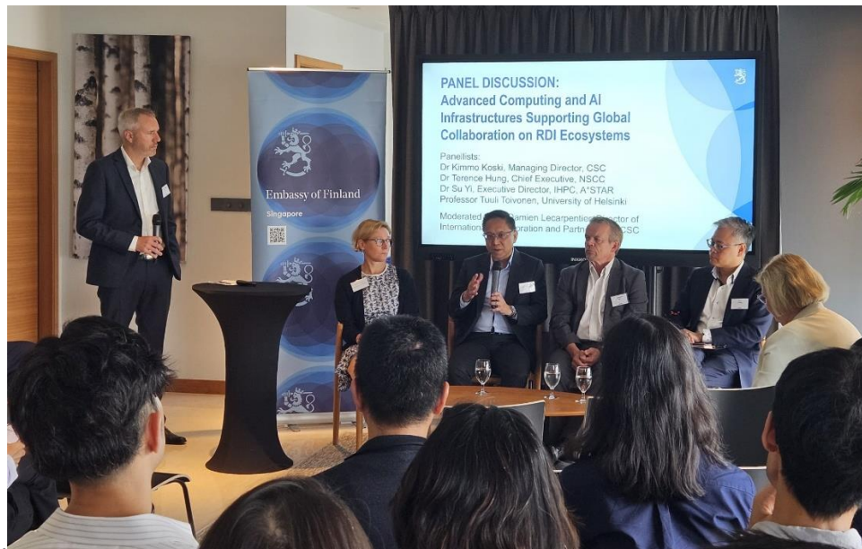
Panel session on the critical role of advanced computing in research, the economy, and society.